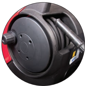
Integrated Hose Reel

TX range of electric cold water pressure washers offer an unsurpassed combination of styling and engineering excellence. Manufactured to the highest quality with unbeatable levels of reliability and durability.