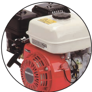
Honda GX200 Engine

*Net power @ 3600 Rpm in accordance with SAE J1349