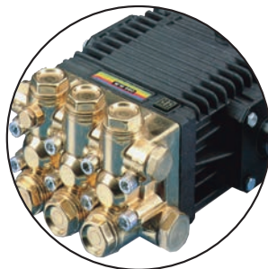
Interpump 44 Series