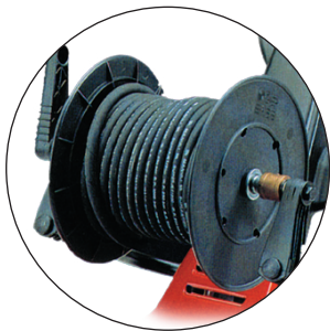
Optional Hose Reel

TX range of electric cold water pressure washers offer an unsurpassed combination of styling and engineering excellence. Manufactured to the highest quality with unbeatable levels of reliability and durability.