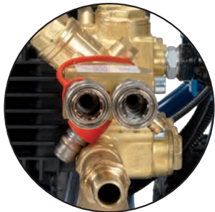
Twin Outlet fitted as standard

A key feature of the Thor is the unique Vibroflex torsional drive coupling. Located in-between the engine and gearbox it eliminates the on-off stresses and snatch effect that can occur when a conventional hollow to solid shaft drive system is used.