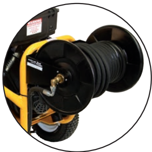
Optional 40m Hose Reel Available

With its high performance Briggs Vanguard V-Twin engine driving a 1450 Rpm Interpump 66 Series triplex plunger pump via a 2:1 gearbox you can be assured of a long and trouble free