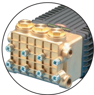
Interpump 66 Series

*Net power @ 3600 Rpm in accordance with DIN ISO 1585